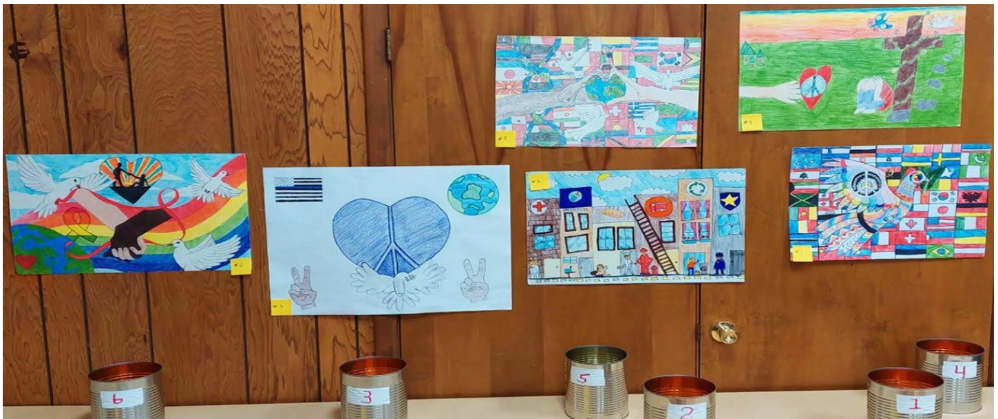
These are some of the posters submitted by various clubs.