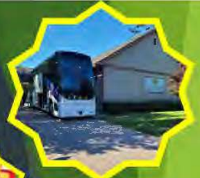
Transportation provided by: Midnight Madness