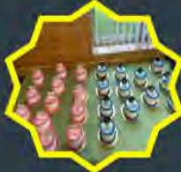
Individual and personalized Birthday cakes: