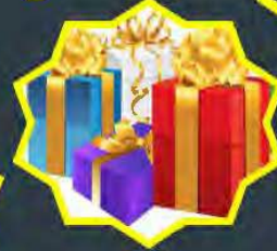
Oodles of gifts