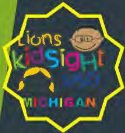
Kidsight came out and leant a hand