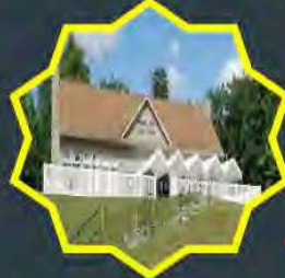
Bear Lake Camp