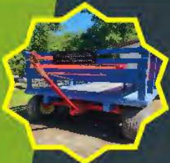
Hay Wagon donated to Bear Lake Camp: NPHHP, Jeddo & Lexington Lions