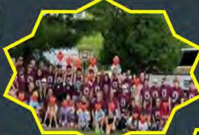
10% of foster children in Sanilac & St Clair sent to camp